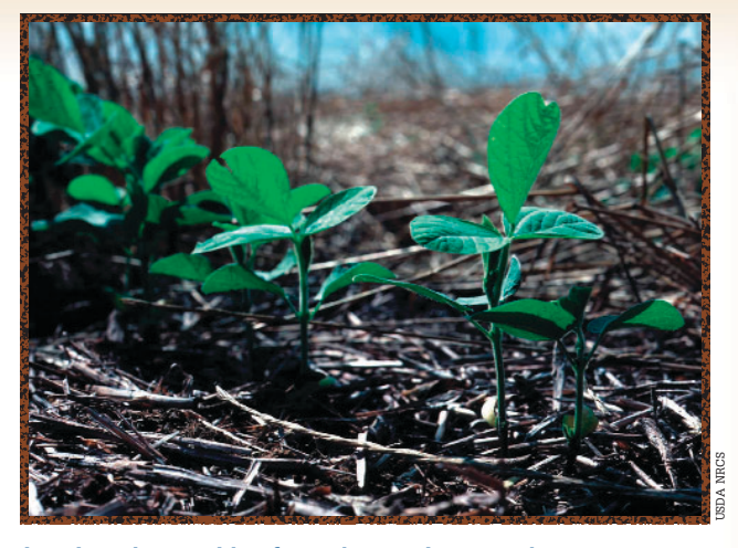
Leaving plant residue from the previous year's crop can increase the level of soil carbon sequestration in organic fields.

Recently, some world governments have promoted soil carbon sequestration (storage) as a way to help mitigate elevated levels of atmospheric CO_2 caused by burning fossil fuels and other sources of industrial pollution. The use of crop rotations, effective manure management, and green manure crops as required for effective and efficient organic