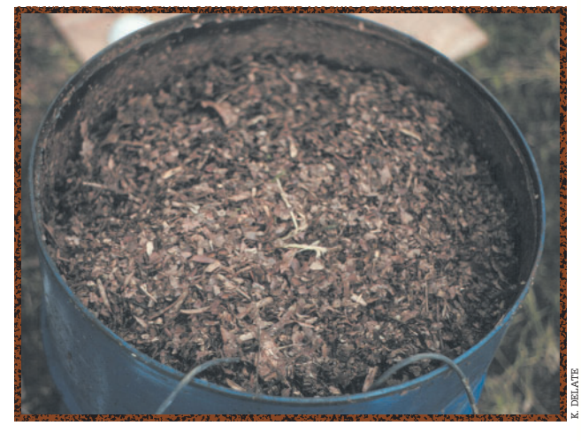
Compost can be made in a 50-gallon barrel, with a front-end loader or with a commercial windrow turner.

are required for proper composting. Most organic farmers utilize front-end loaders or windrow turners to construct outdoor composting systems. Other composting systems include vermi-composting